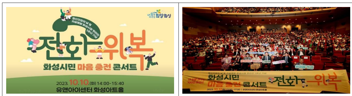
Figure 16. [Good Practice 3] Suicide Prevention Hot-Line: Recharge Hwaseong Citizens' Mind Concert: 'Turning Crisis into Opportunity'