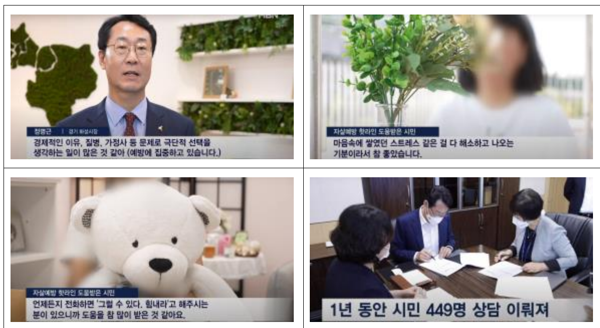
Figure 15. [Good Practice 3] News Release on Suicide Prevention Hot-Line