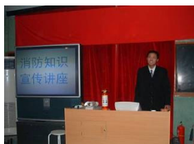
Lecture on Firefighting common knowledge

(3) Fire prevention in middle school. Schools invite the Fire Brigade Squadron yearly to provide lectures on common knowledge of fire safety, fire facilities and prevention methods for students and teachers.