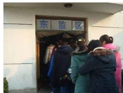
Visiting juvenile detention houses