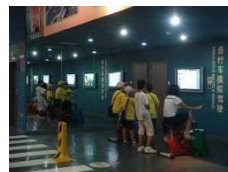
Visiting the Haidian Public Safety Museum