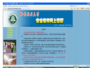
“Safety Accompanies Me” Knowledge Competition “University Students’ Safety Education” Website