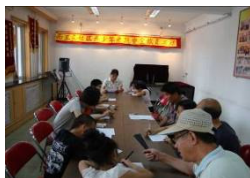
Summer Safety Education