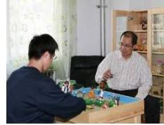
Psychological guidance by a counselor