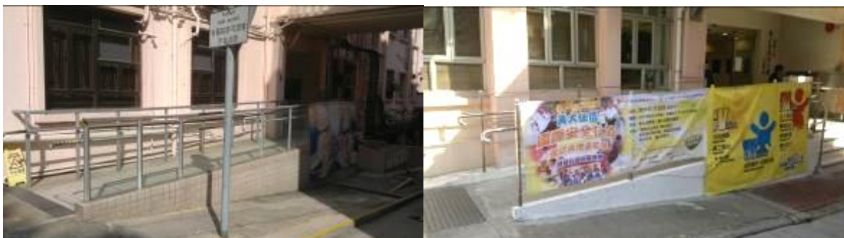
Resurface of the ramp way to reduce risk of slip/fall