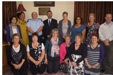
Safer Waitaki Coalition