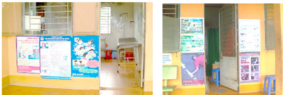
Posters and pictures conveying messages on accident prevention in the corner of health information and education in the Ward Health Station.