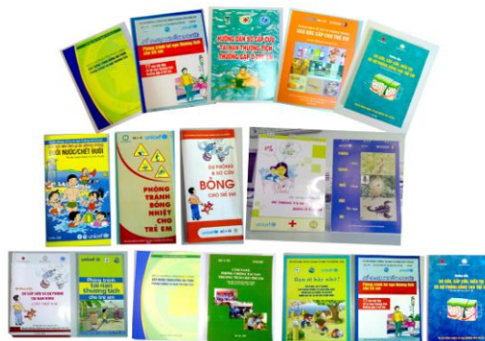
Books of health information and education on accident prevention