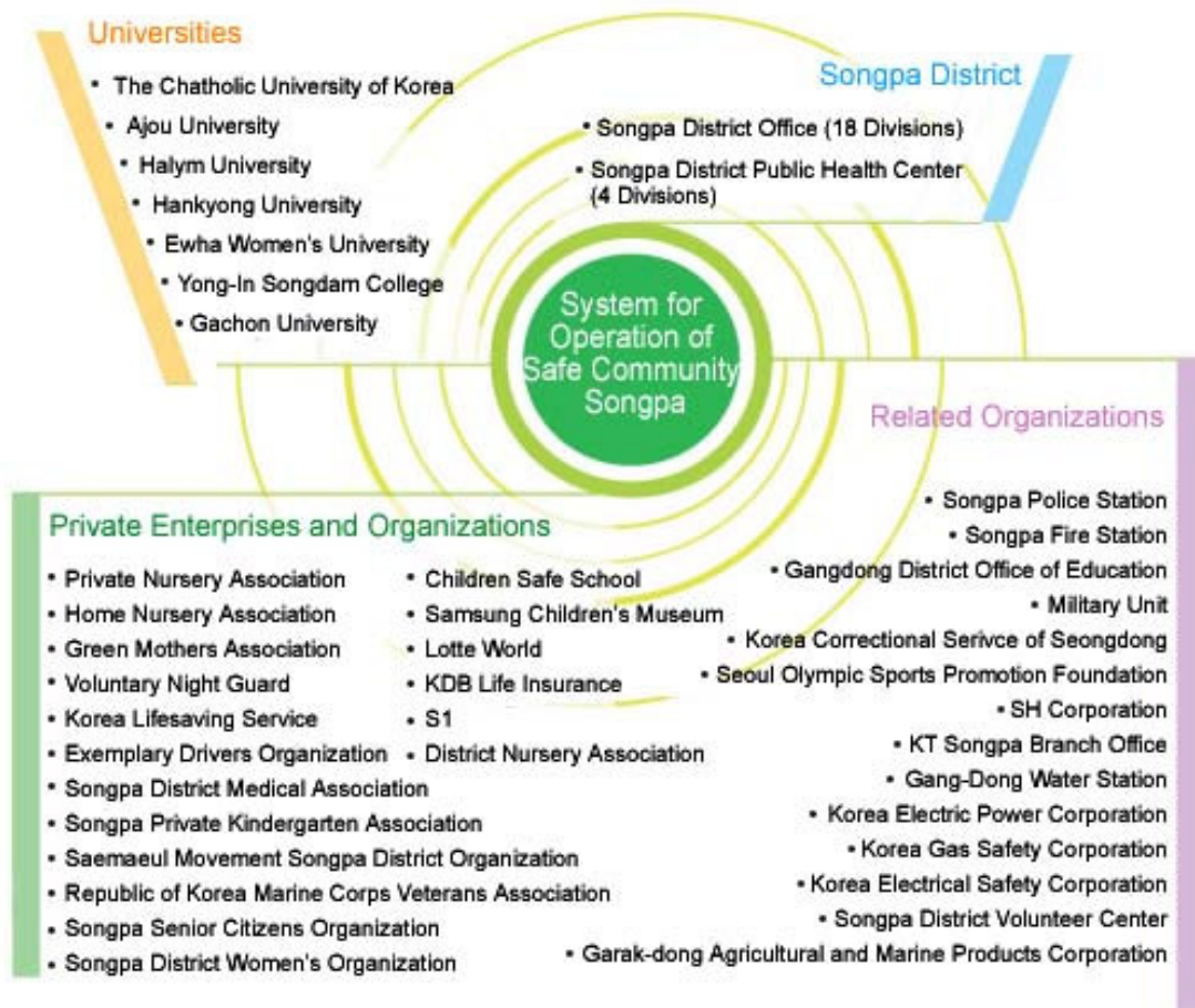
<Figure> Diagram of Safe Community Songpa Network