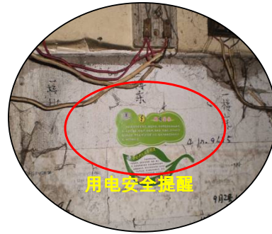
Electricity safety reminder

Strong Foundation Plan of Electricity Use. The sub-district has installed final leakage protectors for famers for free.