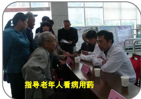
Guiding the Elder to Take Medicine

The Elderly Medication Safety Program. It has held the elderly medication safety lectures and promoted portable weekly medicine boxes. The sub-district holds "happy Jiangyin Health March Large-scale Free Clinic" every year.