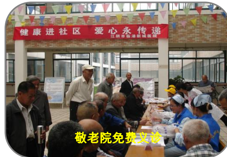
Free Clinic in the Aged Home