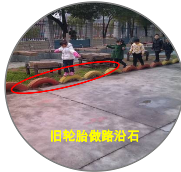
Clamp-preventing Strips on Door Cracks Old tires on Road Edge

The activity venue indoors and outdoors have been equipped with anti-collision angles and anti-collision strips as well as anti-clamping strips have been installed at cracks between doors and frames. The stones on cement road edge in the activity venue have been replaced with junked auto tires. Tile beds have been reconstructed into wooden leisure benches with their edges and corners polished into round ones. The warm tips of “Cautions for Slipping” have been posted on building entrance.