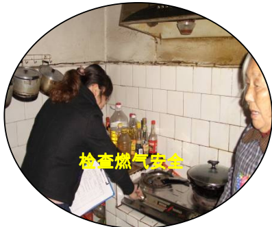
Checking Gas Safety

Residents Dog-raising Self-discipline Group Plan. To strengthen residents' dog-raising management, it has set up dog-raising self-discipline group voluntarily, made civilized dog-raising self-discipline convention, defined dog-walking area and carried out exchange activities of civilized dog-raising.