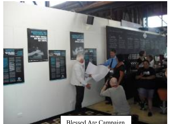
Blessed Are Campaign