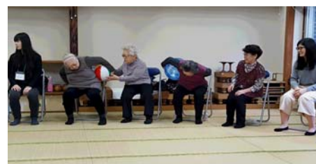
Exercise program for fall prevention