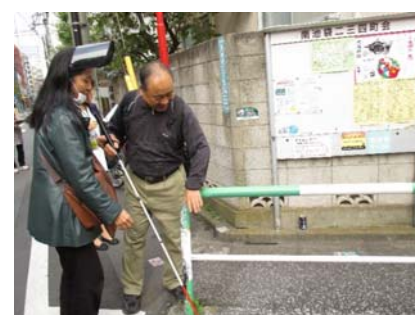
On-street inspection to report on the point of view of the physically disabled