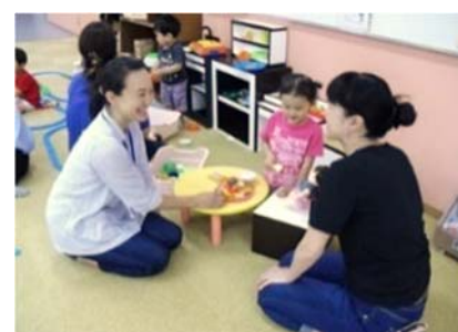
Support to enhance parenting ability