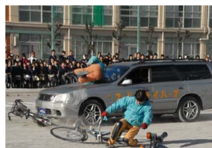
Scared Straight Classes