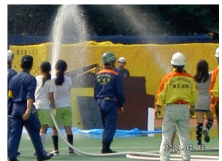
General and joint disaster prevention drills