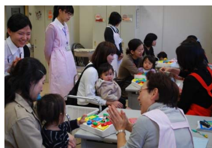
Health classes for parents/guardians