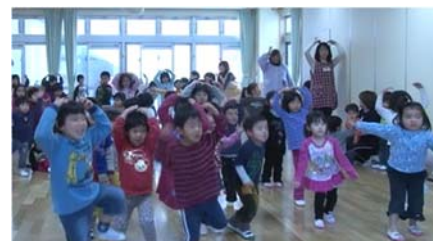
Dancing at municipal nursery schools