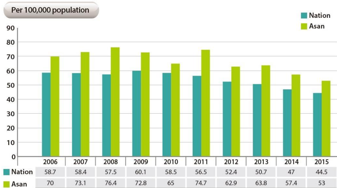
Asan's Trend of Injury Mortality Rate vs. Nationwide Average

Numbers per year: every year since 2014 Population base: 327,955 Started year: 2014