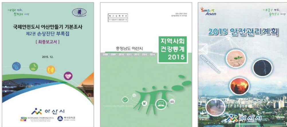
Asan's Publication of Injury-Related Statistical Book