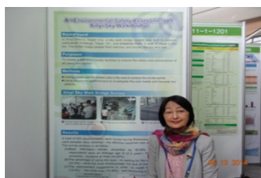
Poster presented in Korea