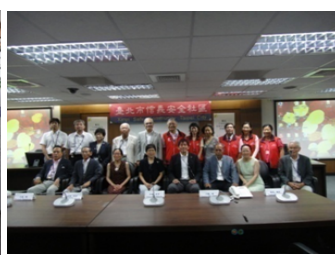
Matsubara City visit Xinyi