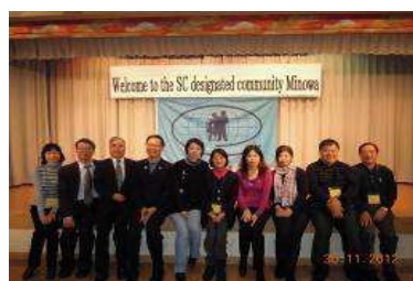
Conference and traveling seminar in Japan