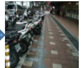
After: motorcycles parked in the parking area to make clear sidewalk