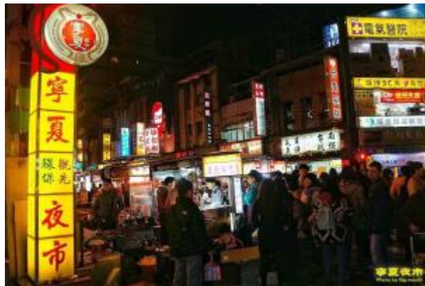
Ningxia Night Market