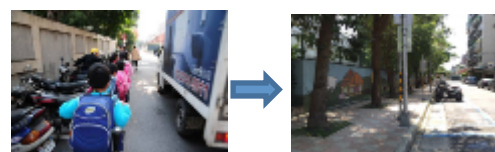
School wall backward for commute path