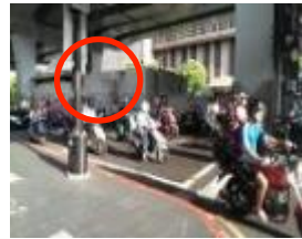
Warning sign and