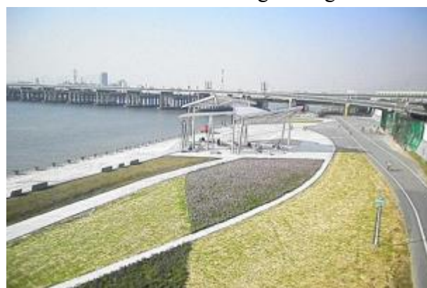
Riverside Bike Trail

Name of the Community: Datong District, Taipei City