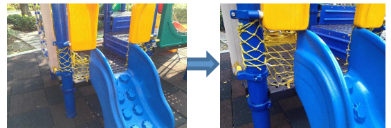
Neighboring Park environment Improvement: Before & After