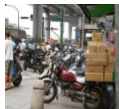
Before: illegal motorcycle parking occupies sidewalk