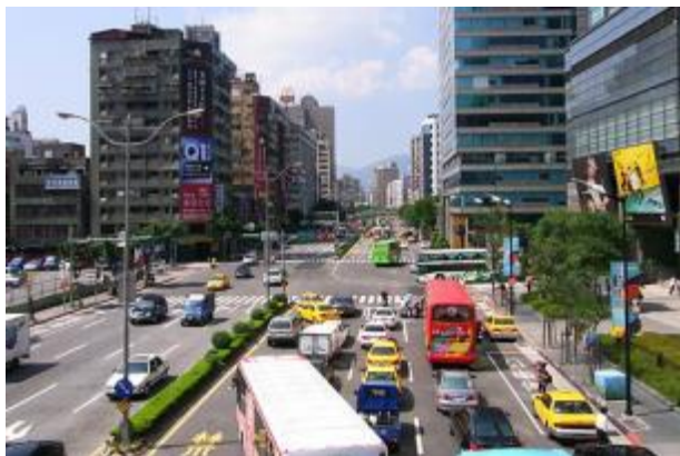
Touring Bus Parking at the entrance to Taipei Bust Station