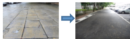
Campus environment improvement: before & after