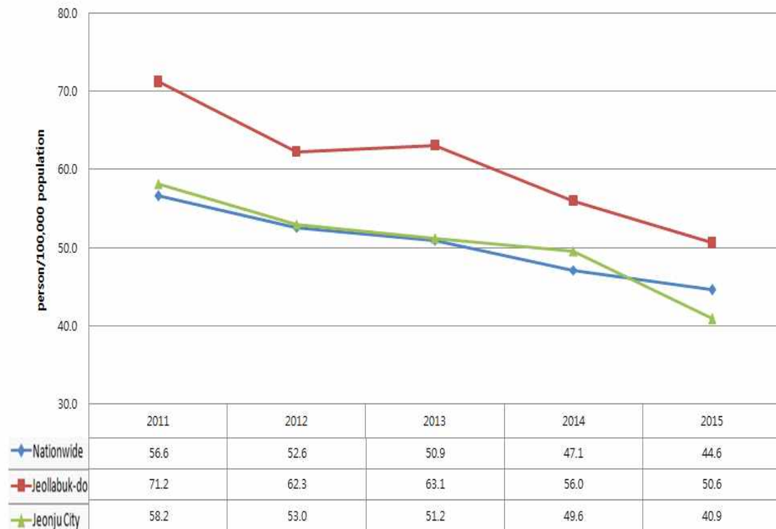
Age-standardized Injury Mortality Rates