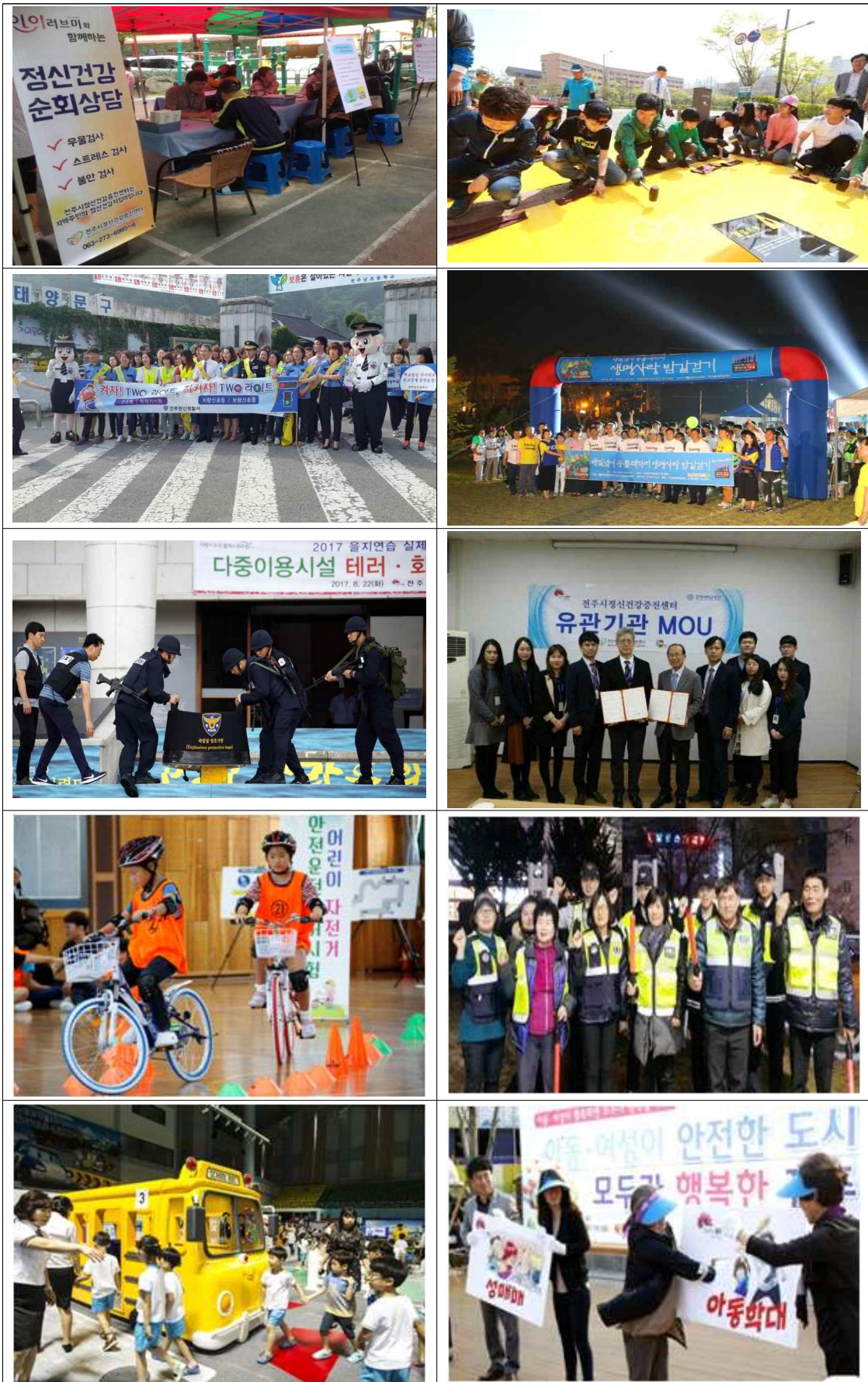
Photo: Typical safety feature

The programme covers the following safety promotion activities: