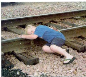
IMPATIENT FOR the late arrival of the he put his ear to the rail he would be able to American train. 7-year-old (left) of Dan- hear the train coming. He took the advice he for his was told by one of the outliners that if heart. The train arrived shortly thereafter.