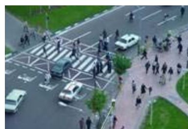
Children's contribution in culture making programs, educational classes for all age groups to Safe Community promotion