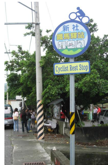
The stop is installed in the police station