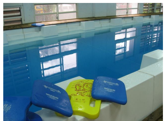
The first indoor swimming pool in Fengbin Township