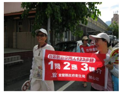
Suicide Prevention Slogan