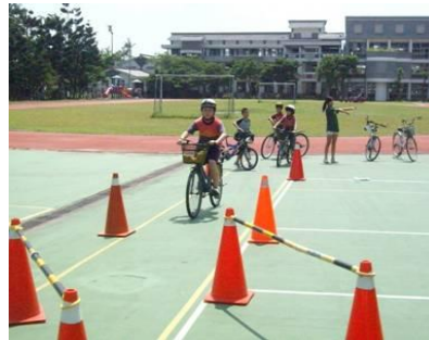
Helmet-Wearing Promotions & bicycle licensing test