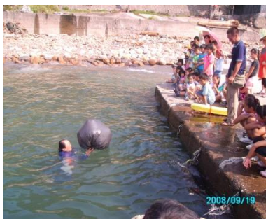
Self-saving & life-saving practice drills for students in Elementary