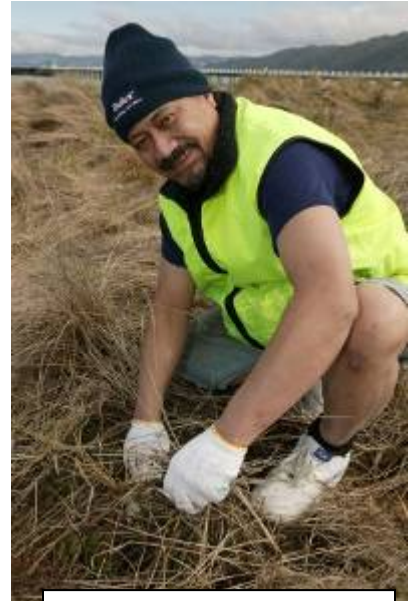
Dulux Workplace Health and Safety