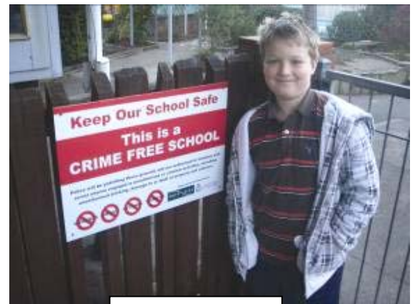
Crime Free Schools