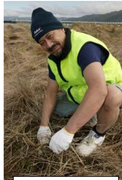
Dulux Workplace Health and Safety